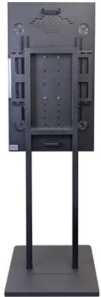
Ultra Bright HD Display